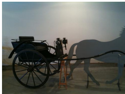
Exhibits at Skyline Carriage Museum.

The 2011 Maine Morgan Spring Membership Meeting was held April 3 rd at the Skyline Carriage Museum. Reports were given on the status of the club and club events. Membership also enjoyed a tour of the carriages of the museum.