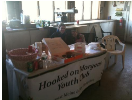
The Hooked on Morgans food table.