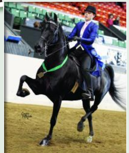
Kate & Queen's Nightwatch